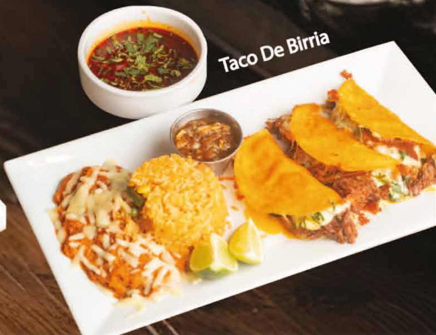
Taco De Birria