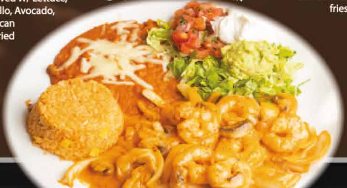
Chipotle Tequila Camaron