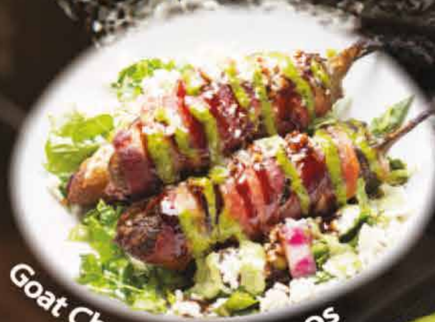
Goat Cheese Jalapenos

Rib-Eye Steak, Marinated In Special Spicy Red Sauce, Red Onions, Cucumbers, Avocado.