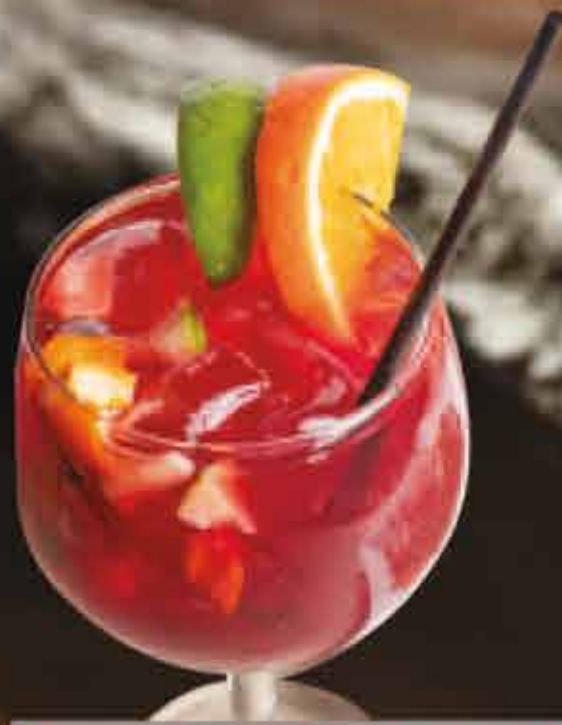
Sangria - 12.99 Roja or Blanca

House Vino - 7.50 Merlot Chardonnay Pinot Grigio Cabernet Moscato